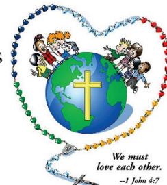
We must love each other. -1 John 4:7

“The greatest method of praying is to pray the Rosary” – St. Francis de Sales