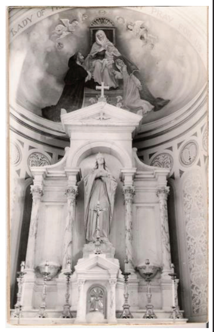
This is the original Painting Our lady of the Rosary at St. Ann East Side Altar

We offer this month to all the Youth and young adults. We pray that God may continue to guide and protect them and bless their life, work and ministry.